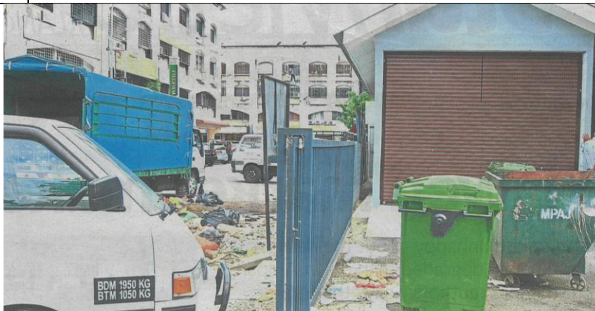
Although there is a refuse room at Pasar Pandan Jaya, it is not open during operation hours and rubbish is dumped indiscriminately outside.