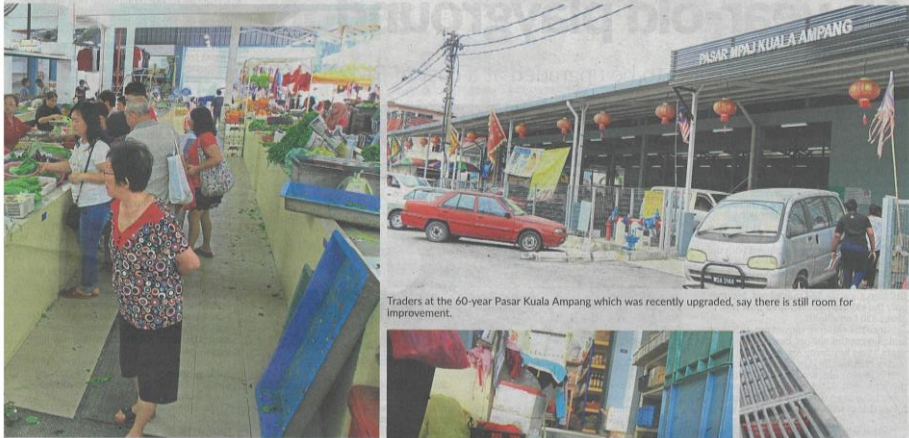
Traders at the 60-year Pasar Kuala Ampang which was recently upgraded, say there is still room for improvement.