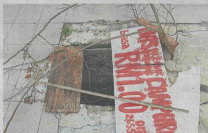
A manhole covered with discarded signage and rotting piece of wood at the Pasar Pandan Jaya. (Right) The lanes between the stalls are too narrow at Pasar Pandan Jaya.

"The lanes between the stalls are too narrow and because there are stalls on both sides, it becomes 'blocked' when customers stop to purchase goods," said a trader.