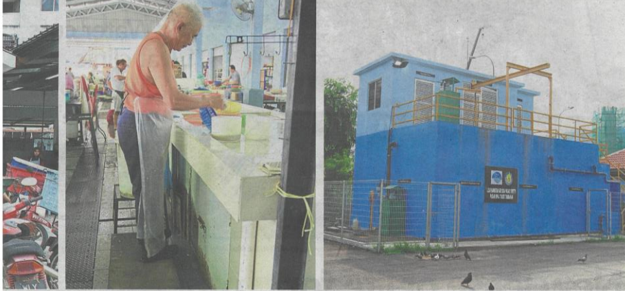
A vendor at Pasar Kuala Ampang has to use a makeshift platform as the concrete tabletops were built too high. (Right) The wastewater treatment plant at Pasar Tasek Tambahan.