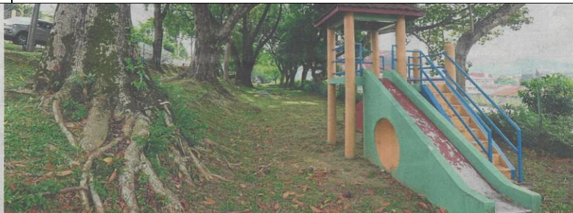
Some of the park's original structures would be retained and new equipment installed.