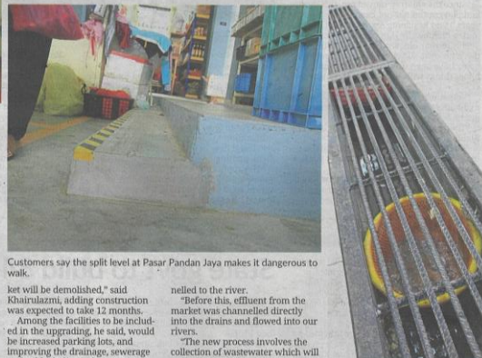
Customers say the split level at Pasar Pandan Jaya makes it dangerous to walk.

"Traders will be moving to a temporary site nearby and the old mar-